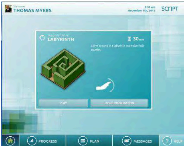
Figure 2: The Patient's home screen

Figure 2 shows the visual design for the patient's home screen. The main navigation is placed at the bottom of the screen to accommodate usage independent of the side of the impairment. This interface was kept very simple and straightforward: Patients may be less computer-literate and might also have impairments associated with their stroke, such as visual neglect which can influence their use of screens. Figure 3 gives an impression of the therapist's UI.